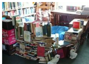
Our lockdown book fort

During the lockdown a lot has been happening in the library. We received over 1000 donated books which have now been catalogued and added to the shelves. We will put together reading lists to cover topics popular with our guests, including new additions, and those which cover Black and Minority Ethnic experiences and theology. You can help support the library through our Amazon Wishlist, which can be found at: https://hilfieldfriary.org.uk/wishlist